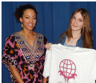
Dubai Kid's Essay Contest Winner

I am thrilled to have, in such a short time, impacted so many lives around the world. We have a lot more to do. We will bring more people together and enhance interpersonal relations. We will educate more people about the impact that cultivating creativity has had and will continue to have in our world.