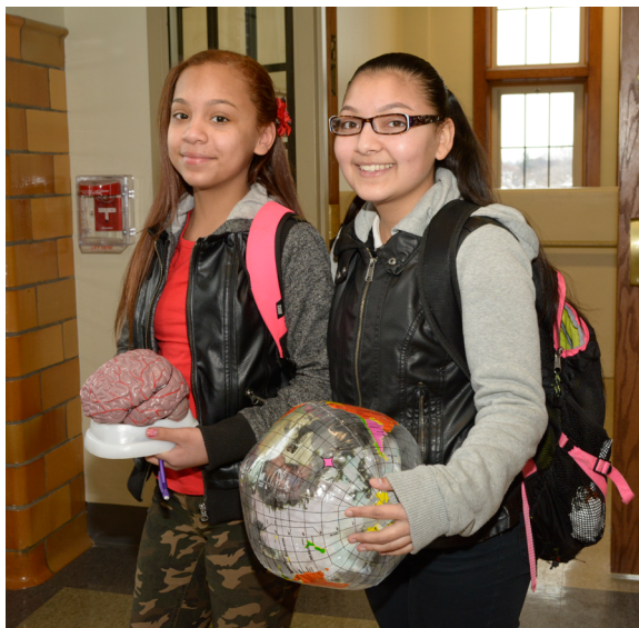
Students learn about Multiple Intelligences and Physiology