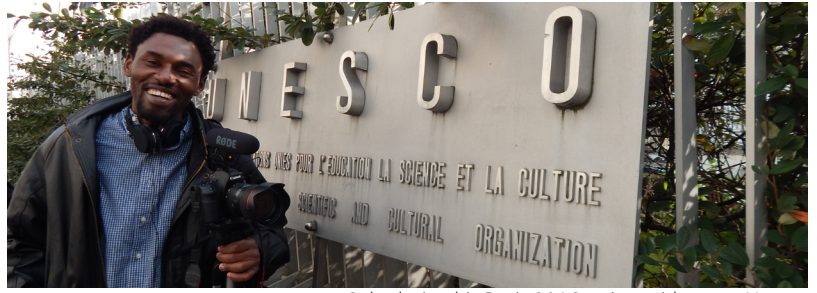
Solo during his Paris 2016 artist residency at Unesco

People from all walks of life, around the world are learning the lessons of peace and love in a way that only the creative arts can convey.