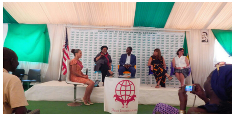
STEAM panel in Senegal

If you have participated in, collaborated on, or supported a previous J Rêve International program, we couldn’t have done it without you. Thank you, your engagement is very appreciated! If you would like to participate in, support, or be involved in J Rêve International’s global programming, please contact us at info@jreveinternational.com . Thank you for reading our first newsletter! You can learn more about our global impact at www.jreveinternational.com .