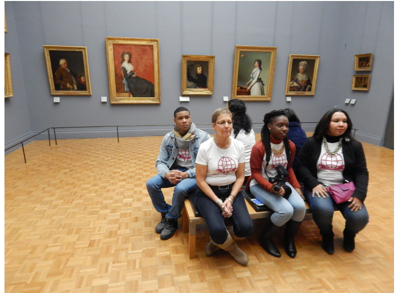
J Rêve Global Educators at the Louvre Museum

There is no question about the role that teachers play in the development of minds around the world. J Rêve International empowers global networks of teachers through training designed to better integrate art education in schools and giving teachers increased awareness of STEAM and Multiple Intelligence education.