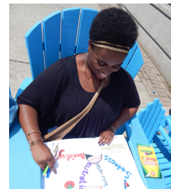
Student learning mind-mapping

To an artist, there is nothing that inspires like travel and collaborating with other artists. The Global Artist Residency Program creates those opportunities.