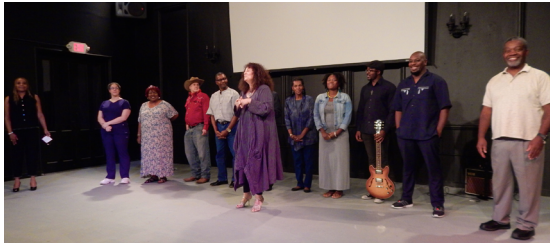
Legacy '64 Theatre performance during Rochester's Fringe Festival

Legacy of '64: Soul of A Nation™ explores the events after the riots Rochester, NY, July, 1964. J Rêve International is sourcing creatives and providing meaningful guidance for the program. On July 30th, 2016 the Legacy '64 campaign will bring awareness to “post-riot collaborations” that took place to heal the city. The event will take place at the historic Oak Hill Country Club.