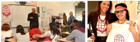
Global Essay Contest Winners: Senegal, India, and Rochester, NY