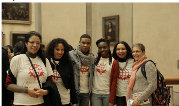
Global Educators in Paris at the Louvre's Mona Lisa

In the same way that as diamond reflects its rainbow of light, J Rêve International shines its light in many ways offering a variety of opportunities for people to come together and transform the world. In this newsletter you will find brief descriptions of each program, each a gem that has a glow unto itself. They represent a few of the ways that you can participate in touching the world in a meaningful way with results that last.