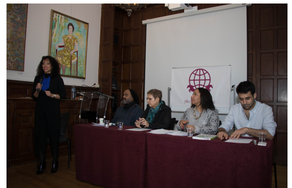
STEAM Panel Paris

"My creative team and I are proud dreamers, aspiring to enlighten, entertain and educate, simultaneously. Our goal is to bring people together through intercultural creative exposure. This pursuit informs all of the projects that we pursue. At the heart of creativity is peace and love."