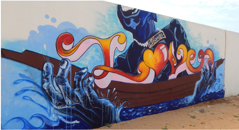
Inaugural Choose Love Mural in Dakar, Senegal